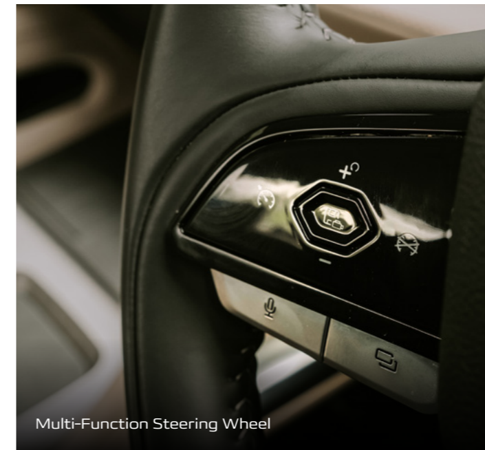
Multi-Function Steering Wheel

The cabin integrates the latest in modern convenience with wireless charging, a high-definition driver information display. Seamless mobile integration is delivered through a panoramic 12.3-inch infotainment screen with mobile phone mirroring, ensuring that you're always connected, wherever the road takes you.