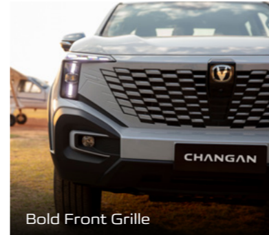
Bold Front Grille