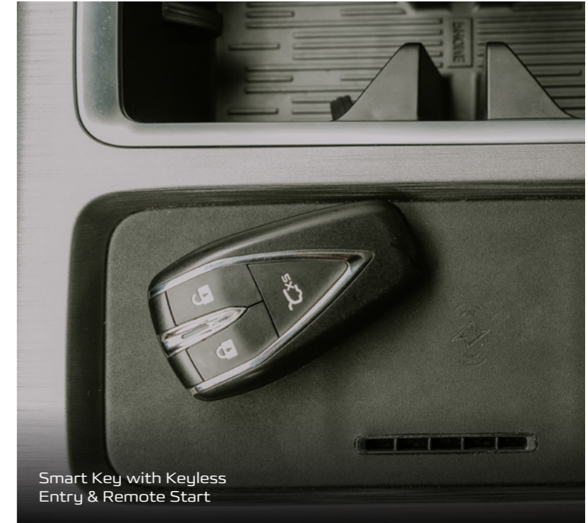
Smart Key with Keyless Entry & Remote Start

From the moment you approach, the Hunter REEV makes life simpler with keyless entry with push start/stop, remote window operation and remote start capability. No more fumbling for keys, just walk up to the Hunter REEV, get in and go.