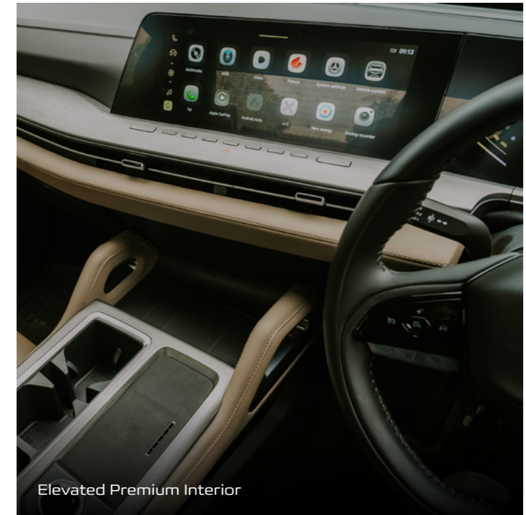
Elevated Premium Interior

Soft-touch surfaces, refined detailing and ventilated high-quality leather seating provide a level of luxury reserved for premium EV-SUV's. Every surface has been crafted for tactile comfort, ensuring both driver and passengers feel at ease no matter the journey.