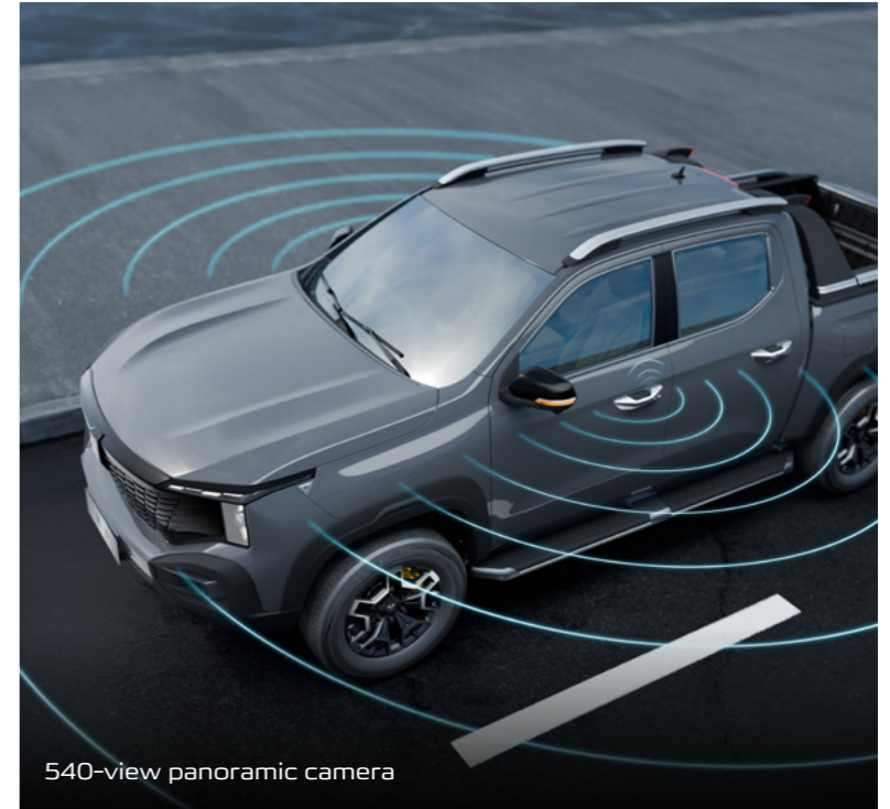
540-view panoramic camera

Parking becomes stress-free with a 540° view high-definition camera reverse camera system with parking sensors, adaptive cruise control and a tyre pressure monitoring add layers of ease and reassurance to your daily drives.