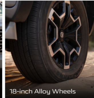
18-inch Alloy Wheels